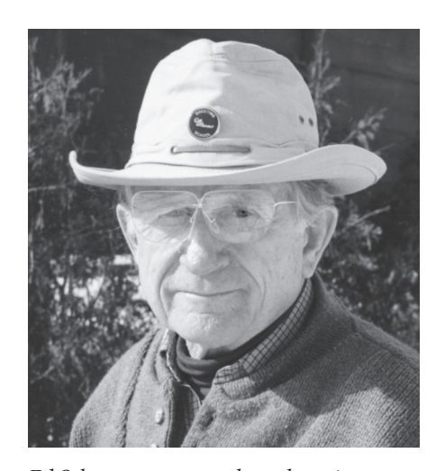
Ed Scherer was a popular columnist on instruction for Skeet Shooting Review during the 1980s and 1990s. He passed away in 1995. The following is a print from March 1991.

great share of shoot-offs are won or lost on this station, thus Station 4 moves to the forefront as a critical station. All the basics of proper footwork, smooth swing, seeing the correct lead as trigger is pulled and head remaining frozen on the comb must be properly executed here or all is for naught.